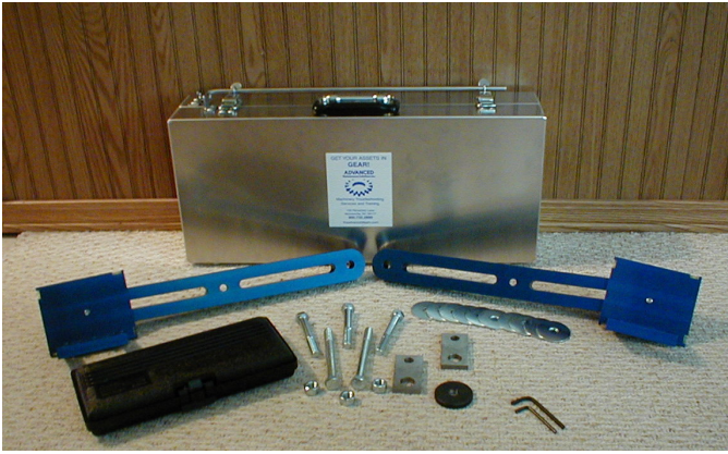
Complete Cardan Shaft Alignment Fixture System