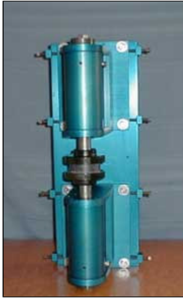
Alignment demonstrator in different configurations